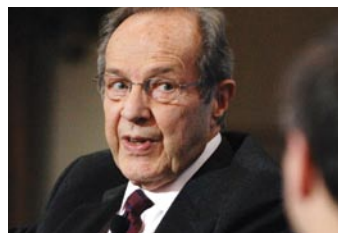
Left photo: Wesley Clark, senior fellow, UCLA Burke Center. Right photo: William Perry, senior fellow at the Hoover Institution and former secretary of defense.

“The DUAL NATURE of nuclear science is NOT UNIQUE, because the principles that we apply in solving the ‘NUCLEAR DILEMMA’ should reflect how we INTEND more generally to DEAL with the use of ADVANCED science and technology in the globalized context of the 21st CENTURY.”