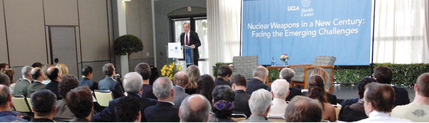
Opening keynote address by William Perry, senior fellow at the Hoover Institution and former secretary of defense.